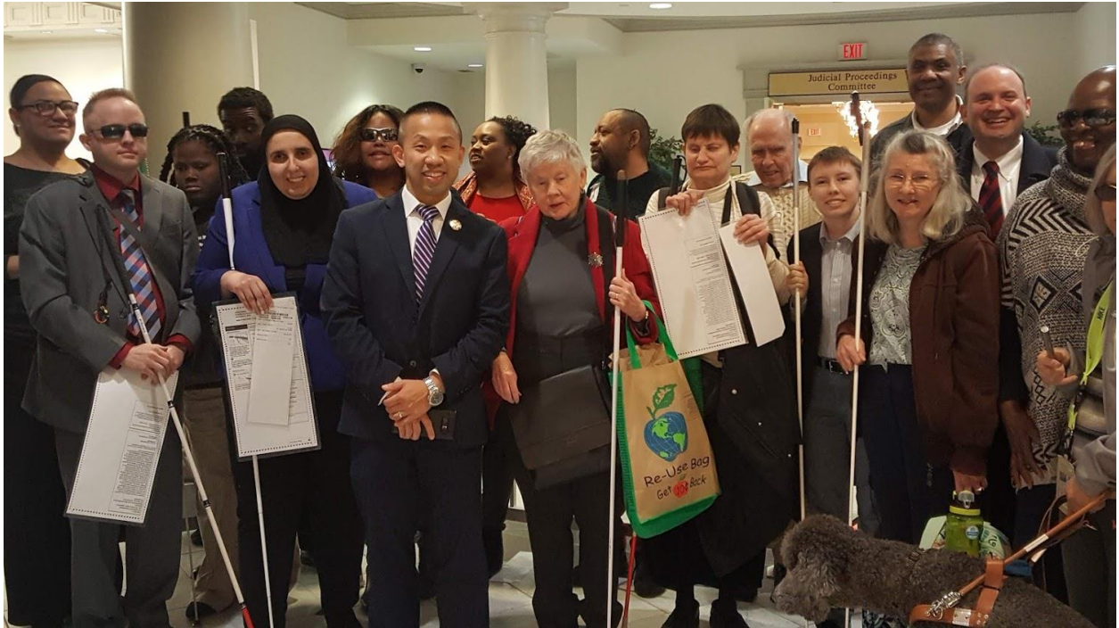
Image: NFBMD engaged in legislative advocacy in Annapolis with Senator Clarence Lam fighting for desegregated voting based on disability